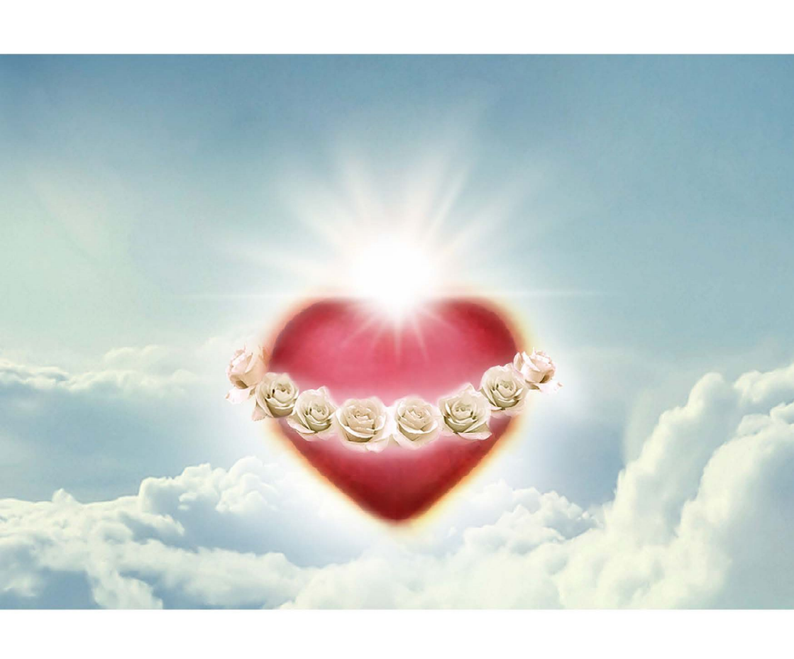
Immaculate Heart of Mary