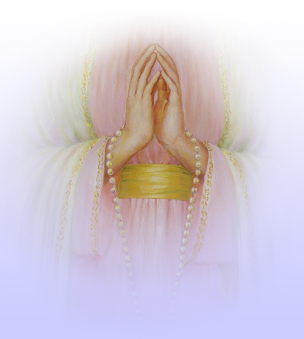
"Prayer, an energy that unites that which was separated".