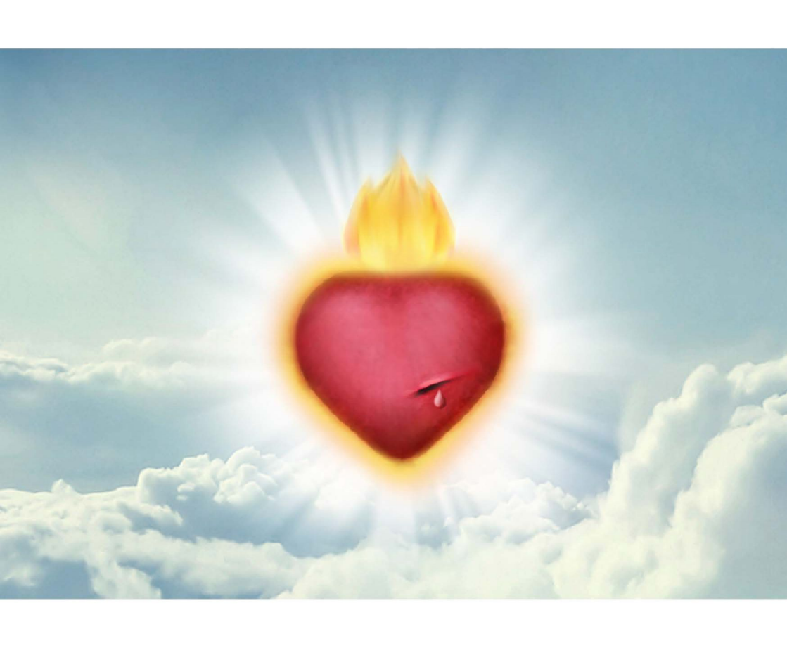
Sacred Heart of Jesus